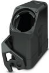
HEAVYCON EVO coupling housing, plastic, with bayonet flange for EVO screw connection, D25, with single locking latch, without EVO screw connection

Please be informed that the data shown in this PDF Document is generated from our Online Catalog. Please find the complete data in the user's documentation. Our General Terms of Use for Downloads are valid ( http://phoenixcontact.com/download )