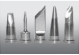
Replacement Soldering Tips W Series