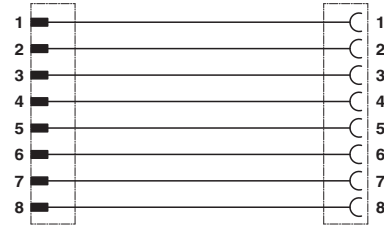
Contact assignment of M12 connector/socket